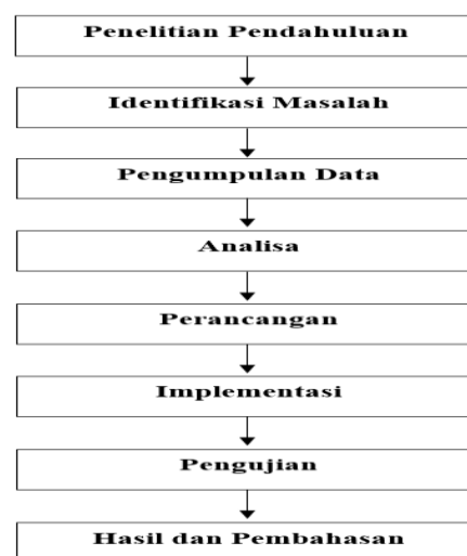
Figure 1. Research Framework

The research framework created in this research methodology has the goal of getting results as expected and easy to solve problems and easy to understand. The steps to be made in this study are arranged systematically. Then a research framework is needed, where the research framework is carried out as shown in Figure 1: